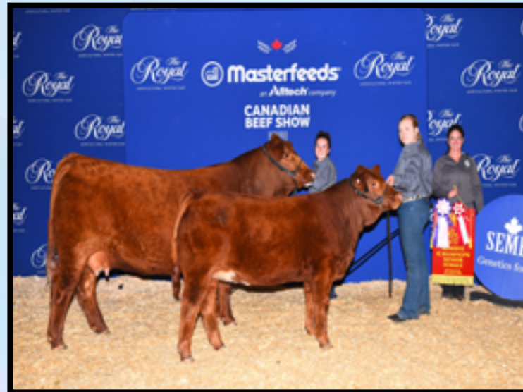
SHOW FEMALE OF THE YEAR LAZY A DESIRE ME

Owned by Arley Cattle Co. / Arcon Cattle Co.