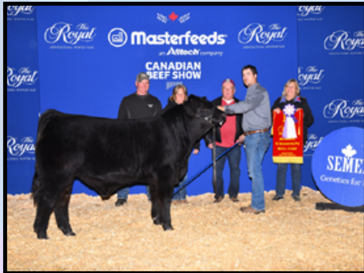
SHOW BULL OF THE YEAR ARLEY'S FLO RIDA

Westlock Agricultural Fair, AB ♦ Darwell Agricultural Fair, AB ♦ Quinte Exhibition, ON ♦ Picton Fair, ON ♦ Warkworth Beef Expo, ON ♦ Oro World's Fair, ON ♦ Farmfair International, AB