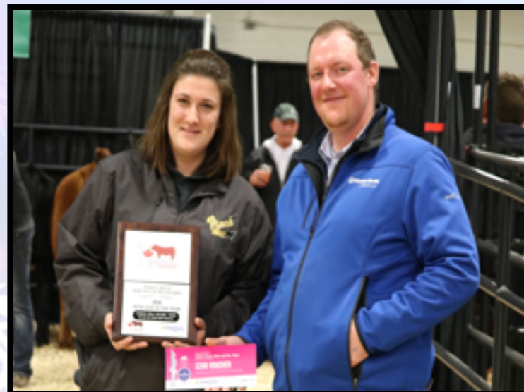
SHOW DAM OF THE YEAR PINCH HILL ZUMBA 203Z