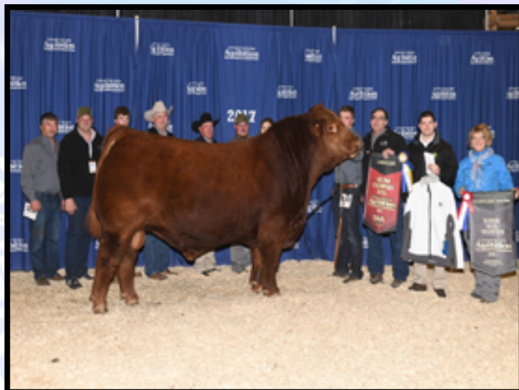
SHOW SIRE OF THE YEAR GREENWOOD CANADIAN IMPACT ET

Owned by Lazy A Limousin & Hollee Limousin