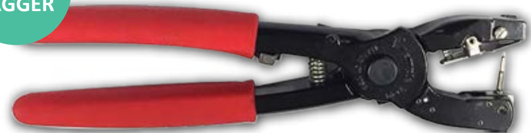
Herdsman II Applicator