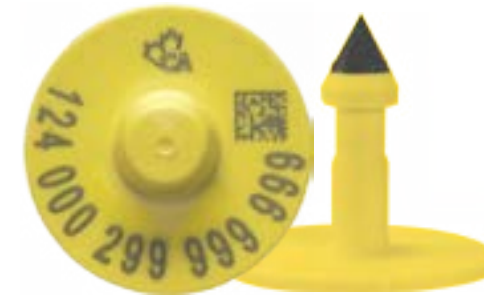
ComfortEar® FDX & HDX

Buy 400 approved CCIA ComfortEar® indicators or approved CCIA breed tag indicators, receive a free Herdsman II applicator!