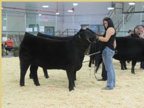
Cottage Lake Livestock's purebred Limousin heifer PKL 904B Cottage Lake Blue Orchid won Reserve Champion Heifer in the open show at the UFA Country Classic Stock Show in Josephburg, AB on May 24th.